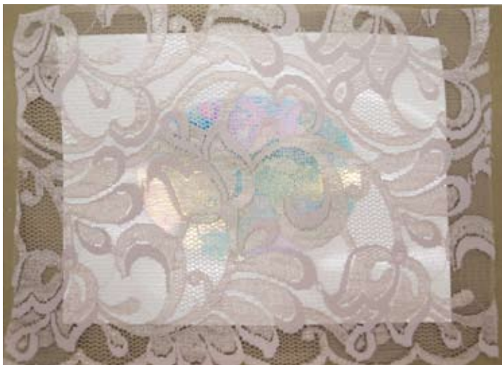
5" x 7" Sticky Paper with Fantasy Film oval in center and covered with lace.

Turn over and trace oval with Sharpie marker. Cut out on outer edge of outline.